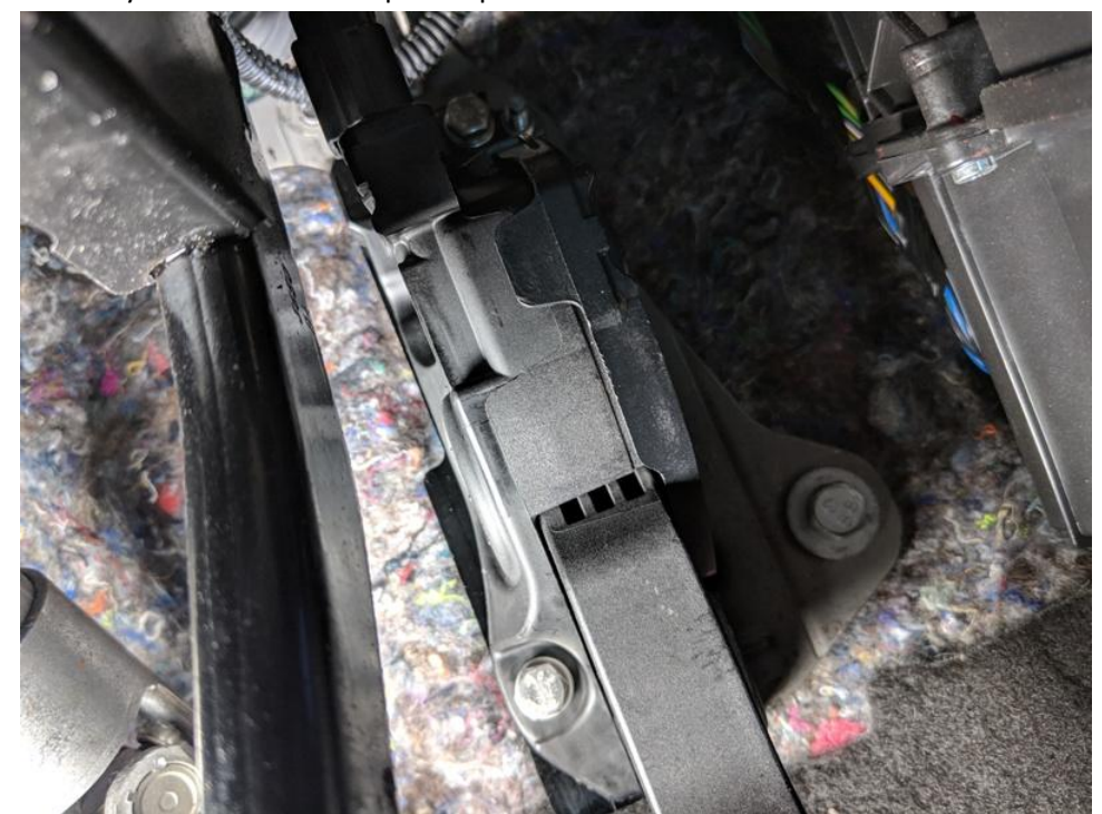
Congratulations!! You've now completed the installation of you New JBR Throttle Pedal Spacer!

3. Using the 2, 6mm bolts, lock washers and flat washers provided, re-install the throttle pedal assembly on to the throttle pedal spacer.