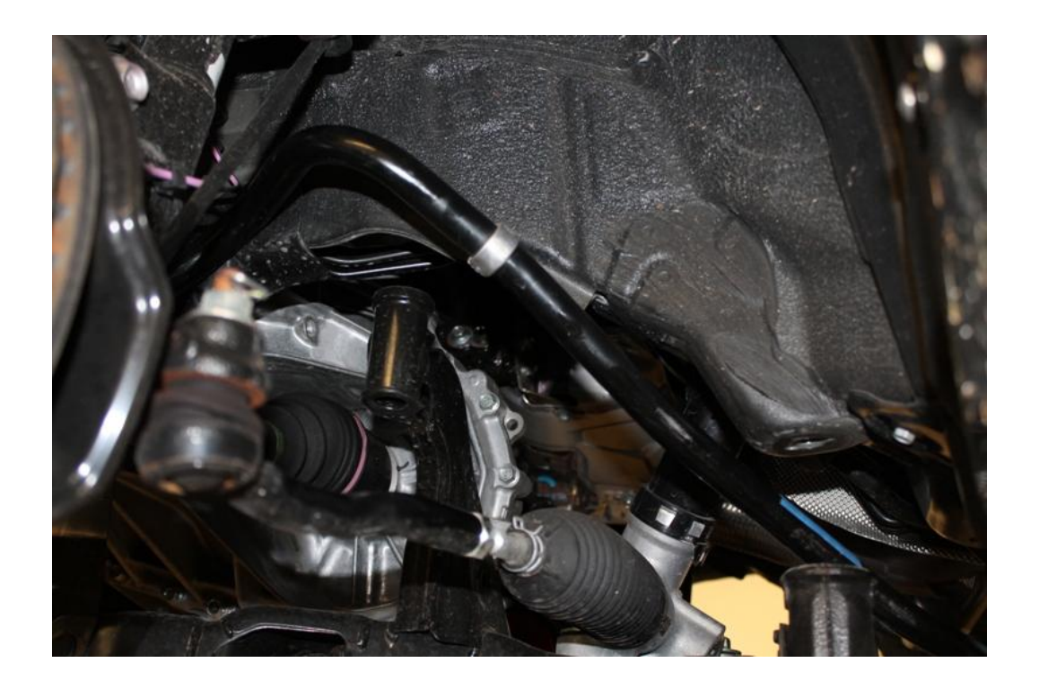
Copyright © 2015 James Barone Racing LLC. Any unauthorized reproduction or publication of this document is a strictly prohibited without the written consent from James Barone Racing.