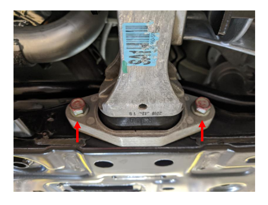
Copyright © 2020 James Barone Racing LLC. Any unauthorized reproduction or publication of this document is a violation of U.S. copy write Law. Violators will be prosecuted to the fullest extent of the law.

2. Using a 14mm wrench, remove the two bolts securing the rear portion of the lower torque mount to the sub-frame.